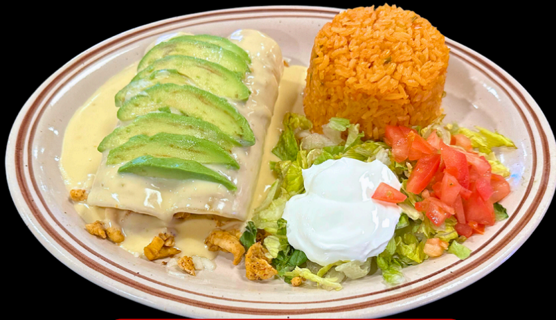
CHICKEN AVOCADO ENCHILADAS