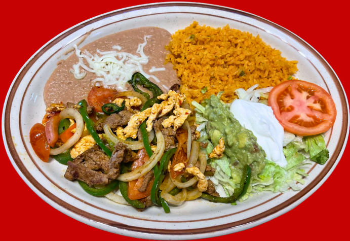
CHICKEN AND STEAK FAJITA