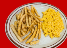
MACARONI CHEESE AND FRIES