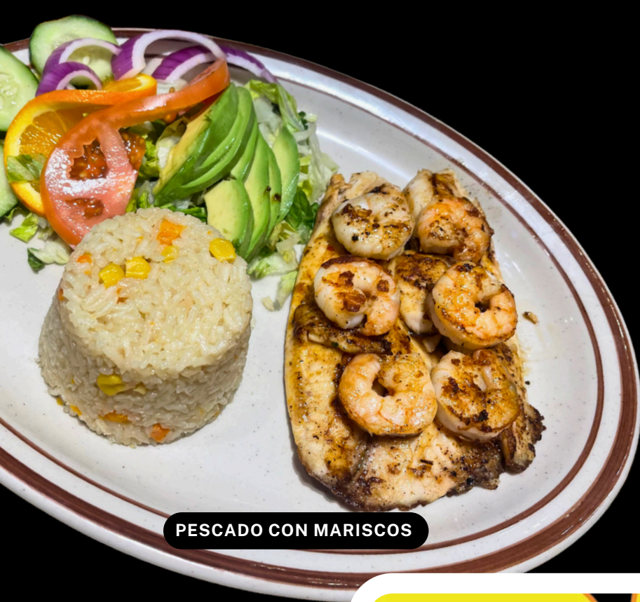
PESCADO CON MARISCOS