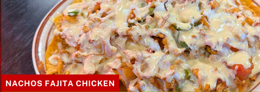
NACHOS FAJITA CHICKEN