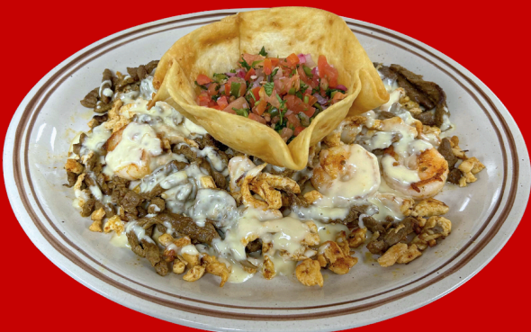
CIELO, MAR Y TIERRA