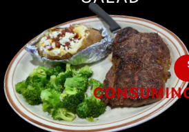
STEAK MUSTANG SPECIAL

SERVED WITH FRENCH FRIES AND TOSSED SALAD