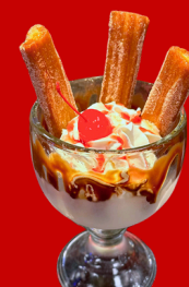
CHURROS WITH ICE CREAM