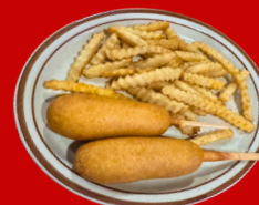
CORN DOG AND FRIES